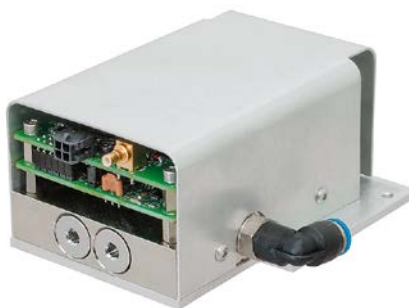
Standard of DP/DP-SP series Pockels cell driver