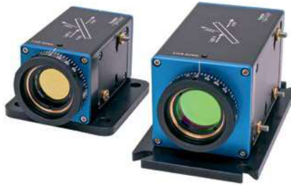
990-0077 and 990-0078 Laser Power Attenuators

This manual variable attenuator series is designed to continuously attenuate linearly polarized laser beams. They feature precision opto-mechanics and high-LIDT optical components incorporated in a compact housing to ensure stable and reliable performance.